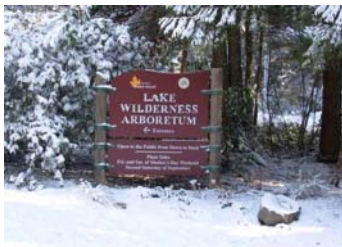
Lake Wilderness Arboretum, December 08